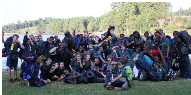
All ready to "trek" from the lake to the top sports field