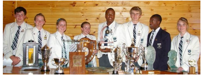
Seen from left to right above with their trophies: