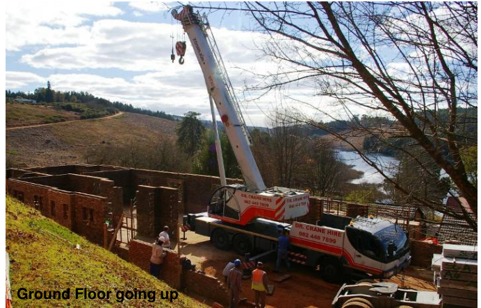
Ground Floor going up